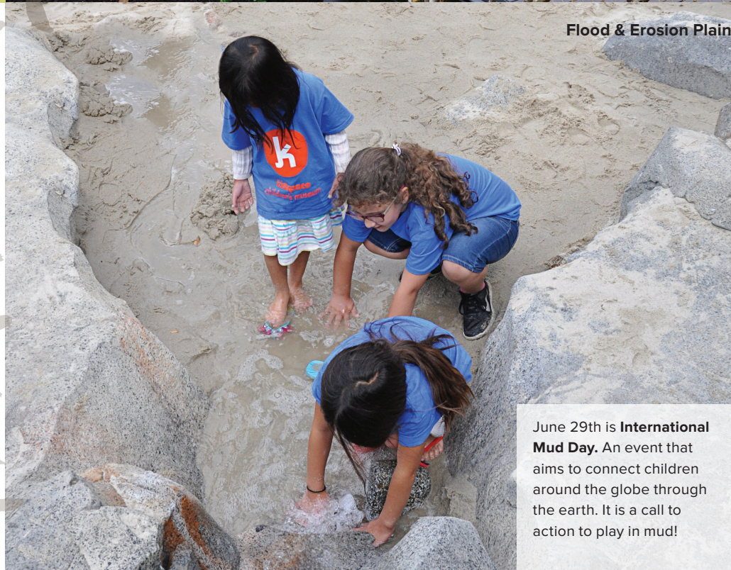
Flood & Erosion Plain

June 29th is International Mud Day . An event that aims to connect children around the globe through the earth. It is a call to action to play in mud!